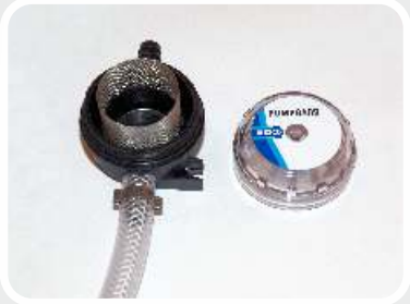
The filtration system features double suction, and equipped with washable filters.