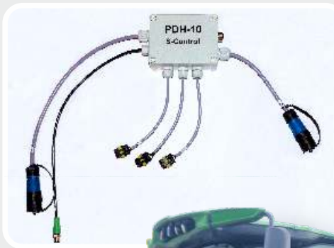
The S-Control provides complete automation of acid application with any harvesting machine. The device has three sensor inputs, each sensor input to start and stop the acid applicator independently. One sensor input is equipped with a trip counter. The acid applicator automatically calculates the loads or bales and the acid to be applied.