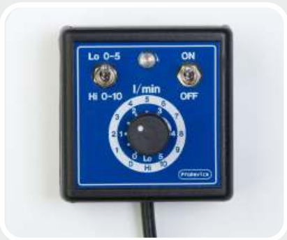
The standard compact control is easy to install in the tractor cabin. An LED indicator warns of any problems. The desired dosage rate can be set directly to the applicator nozzles. Can be used in combination with the S-Control: in which an automatic acid application rate can be set without the use of a trip counter.