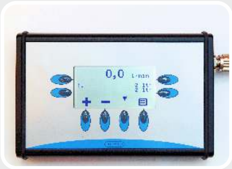
Optionally available is this display device. Here the application system has a trip master function, a designated counter with 8 memory locations, as well as programmable transfer pump function, along with the S-Control: in which a fully automated application setting can be created.