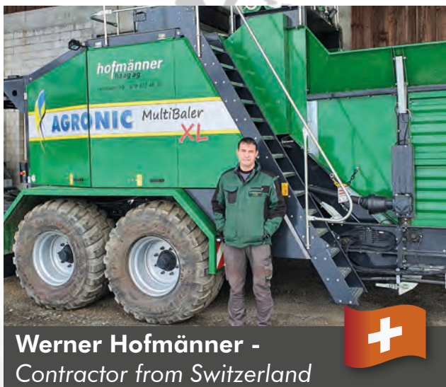
Werner Hofmänner - Contractor from Switzerland

"The MultiBaler XL runs flawlessly and the employees are enthusiastic!"