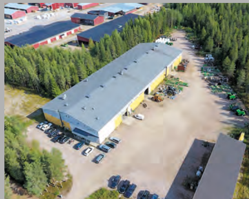
Agronic Oy Haapavesi, Finland

Great cooperation creates great machines for satisfied customers!