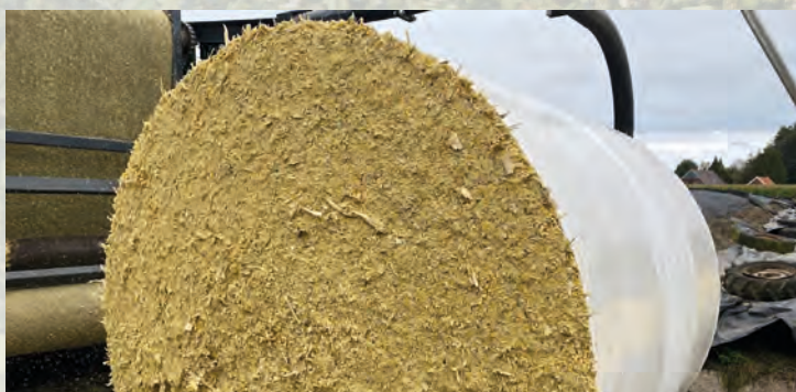
Corn Cob Meal