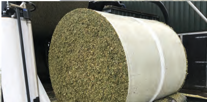
Maize / Corn

Any type of material can be processed, from agricultural crops to industrial processing of waste products, we are happy to accept the challenge!