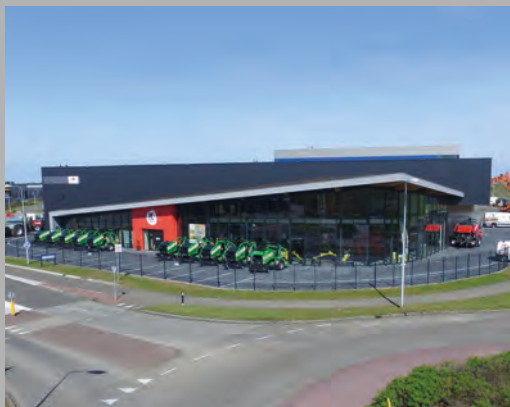
Knoll B.V. - Staphorst, Holland