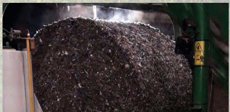
RDF / Waste