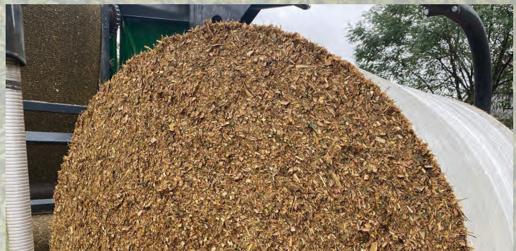
TMR (Total Mixed Ration)